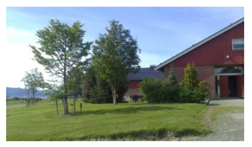
Skjetlein Grønt Kompetansesenter, Trondheim

https://ruralis.no/en/events/2021nordic-meeting